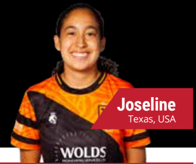
Joseline Texas, USA