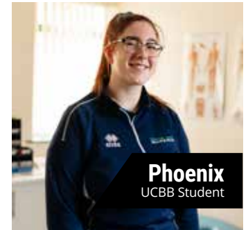
Phoenix UCBB Student

"The ability to get hands-on is fantastic, we have access to equipment and facilities that professional clubs are using and get industry experience whilst studying."