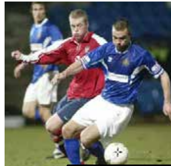
SFS U23 Coach